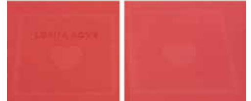
Example of various effects of embossing.

The laser outcome is the determined by the material and might differ from the example below and looks different on each item.