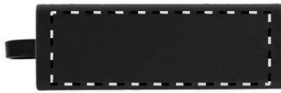
2. FRONT PD