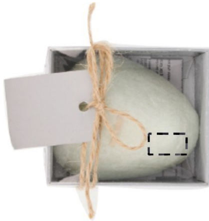
2. TOP LEFT