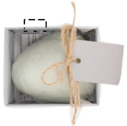
3. BOTTOM RIGHT