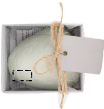
4. BOTTOM LEFT