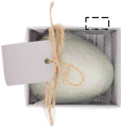
1. TOP RIGHT