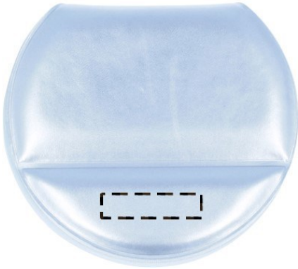
1. FRONT BOTTOM