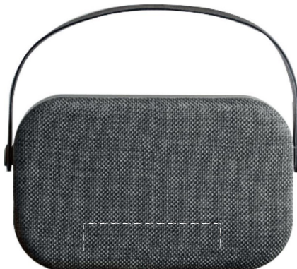
5. LOWER FRONT