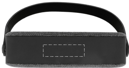
1. TOP PAD