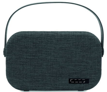
3. METAL PLATE