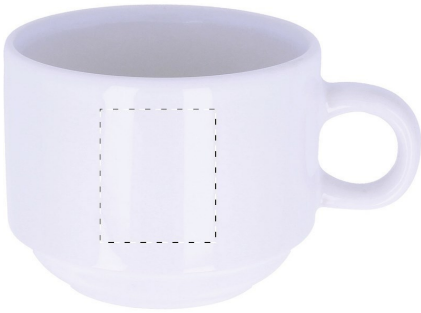
1. CUP LEFT PAD