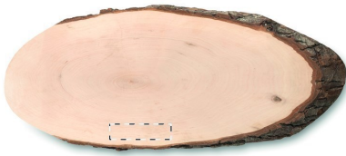
4. BACK PAD