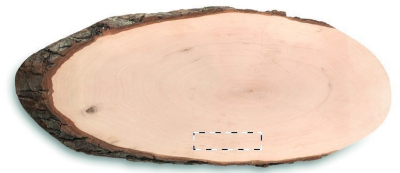
3. FRONT PAD