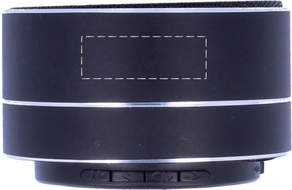
4. SPEAKER BUTTON SIDE