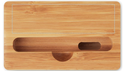
3. TOP UPPER