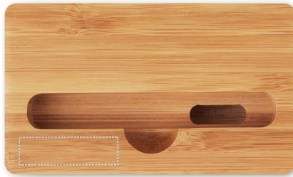
2. TOP LEFT