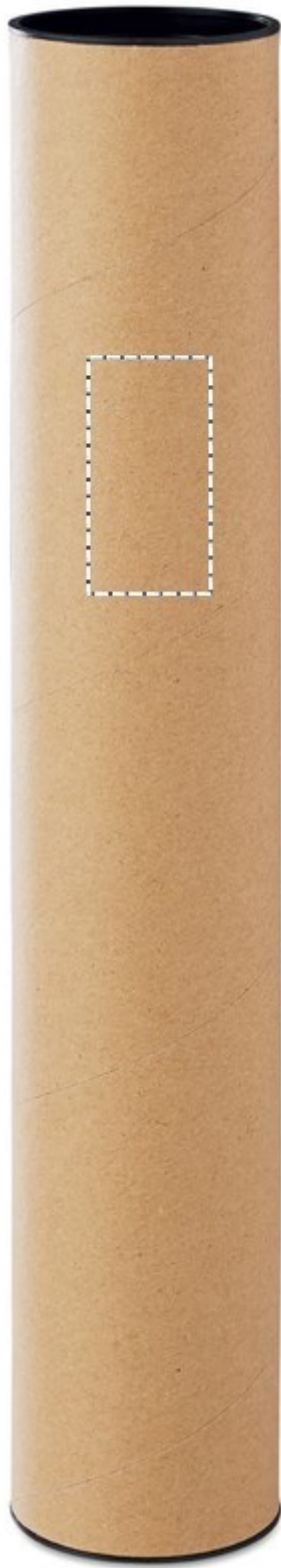
2. SIDE 2