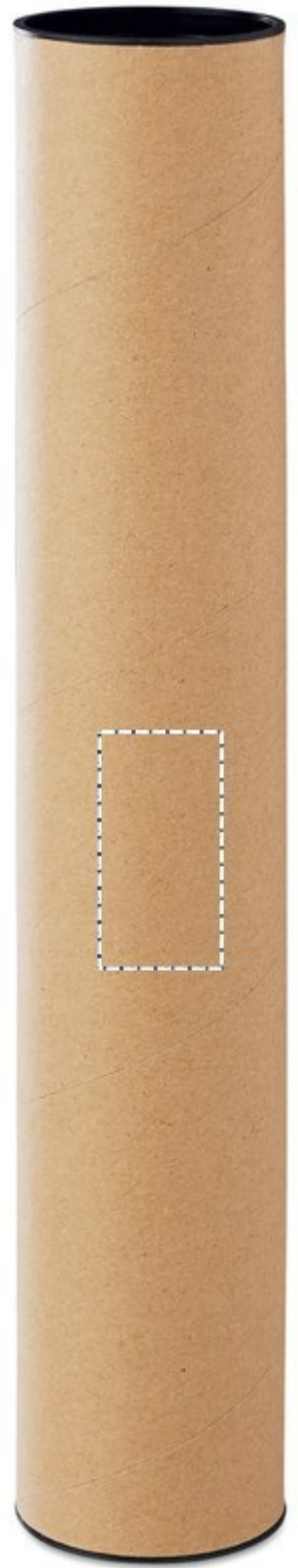
3. SIDE 3